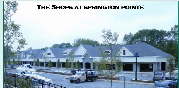
THE SHOPS AT SPRINGTON POINTE