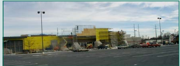
COLONIAL COMMONS SHOPPING CENTER