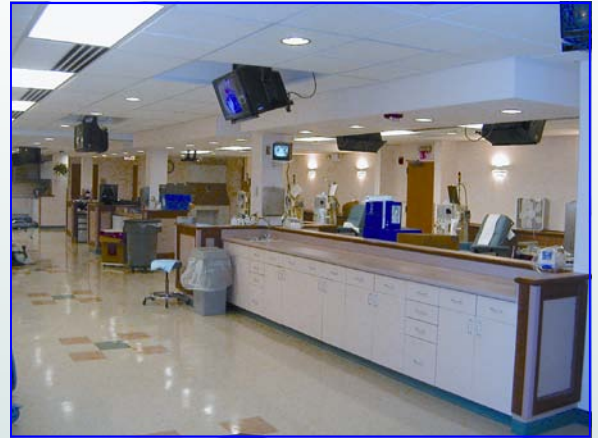
FMC—EPISCOPAL HOSPITAL, PHILADELPHIA, PA

During the summer of 2004, A&E Construction completed two facilities, both with September deadlines.