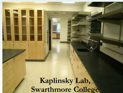
Kaplinsky Lab, Swarthmore College