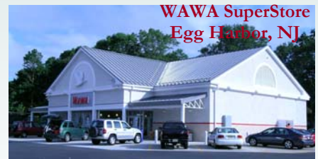
WAWA SuperStore Egg Harbor, NJ