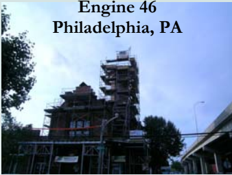
Engine 46 Philadelphia, PA