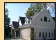
Helen Kate Library