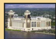
The Wharf at Rivertown