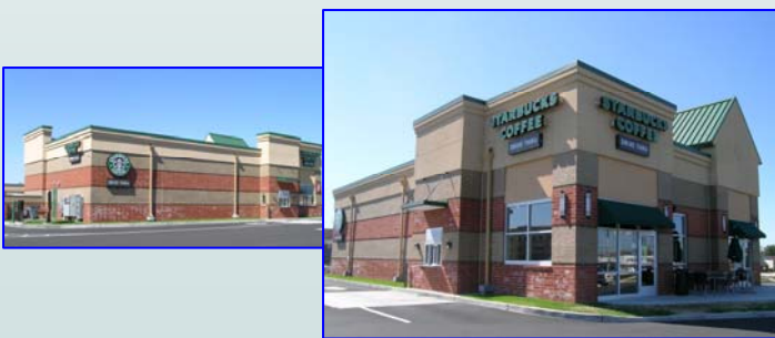
Willingboro Town Center I