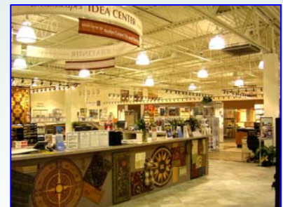
Avalon Carpet Center