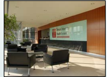
Temple University Health Care Administrative Offices Budd Corporate Center