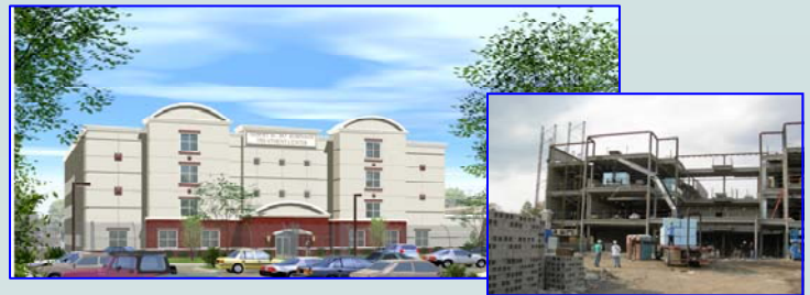
"Bo" Robinson Education and Treatment Center