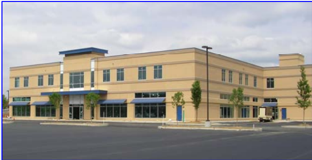
Park Plaza, Willingboro Town Center II