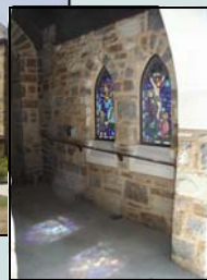
St. John Vianney Church Addition