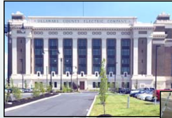
The Wharf at Rivertown