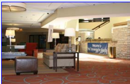
Harrison Conference Center