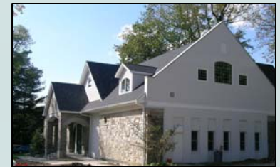
Helen Kate Furness Library

A&E was awarded a contract by The Episcopal Academy of Merion for renovations and additions to their new 185-acre academic campus being built in Newtown Square, PA. The projects include a renovation and addition to the existing mansion and the construction of a new Maintenance Storage Building.