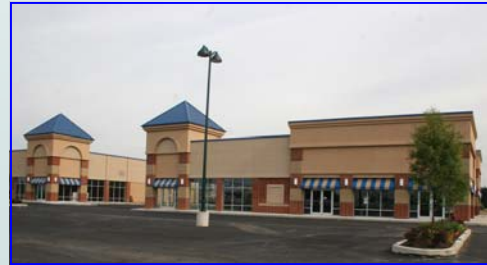
Willingboro Town Center III—North Pad