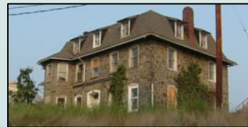
The Episcopal Academy