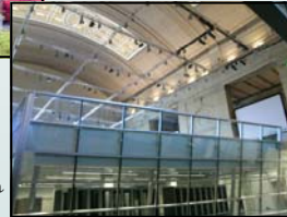
Syngy The Wharf at Rivertown