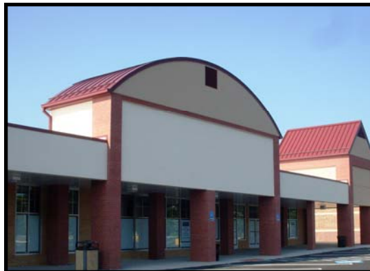
Knights Road Shopping Center; Philadelphia, PA Architect: BL Companies