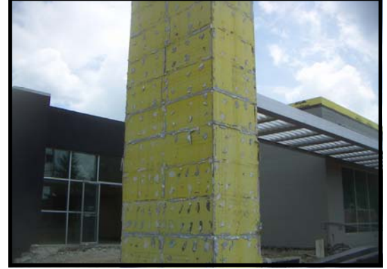
Industrial Boulevard; Paoli, PA Engineer: Bohler Engineers