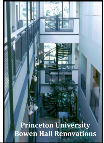
Princeton University Bowen Hall Renovations

The two firms had previously worked together at Princeton University.