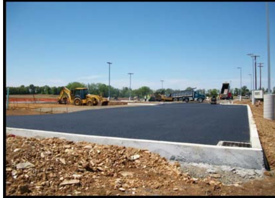
Trexlertown Development ; Lehigh County, PA Engineer: Landcore Engineering Consultants