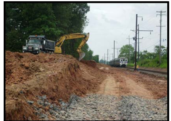
SEPTA: Link Siding; Doylestown, PA Architect: HNTB Corporation