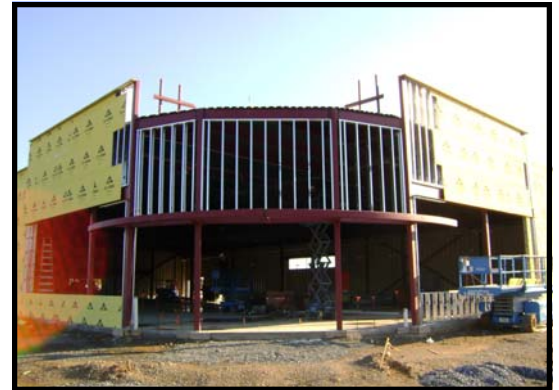
Rite Aid; Exton, PA Architect: Stampfl Hartke Associates