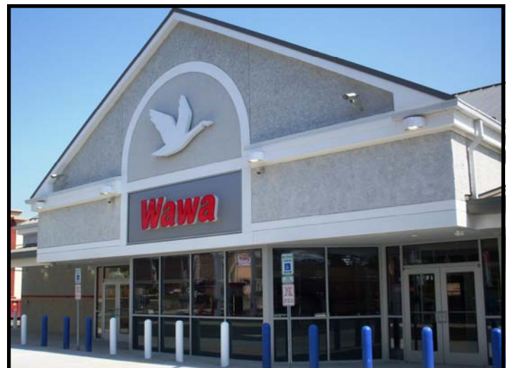
Wawa; Philadelphia, PA Architect: Stantek Architecture, Inc.