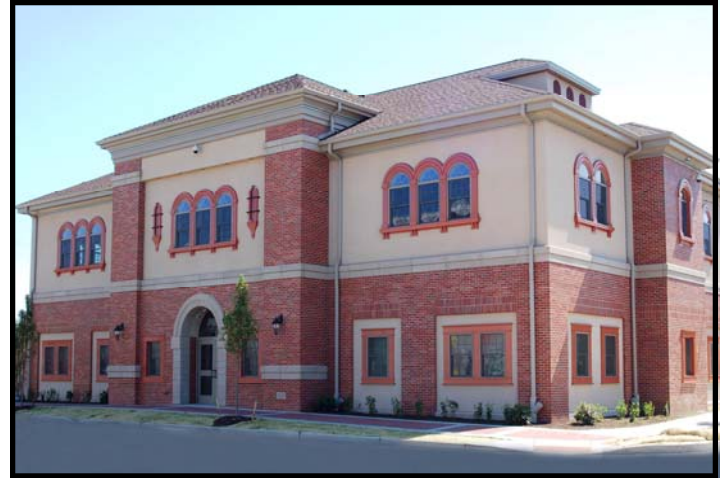
Puerto Rican Unity for Progress; Camden, NJ Architect: Archi-Tecto Studio, LLC