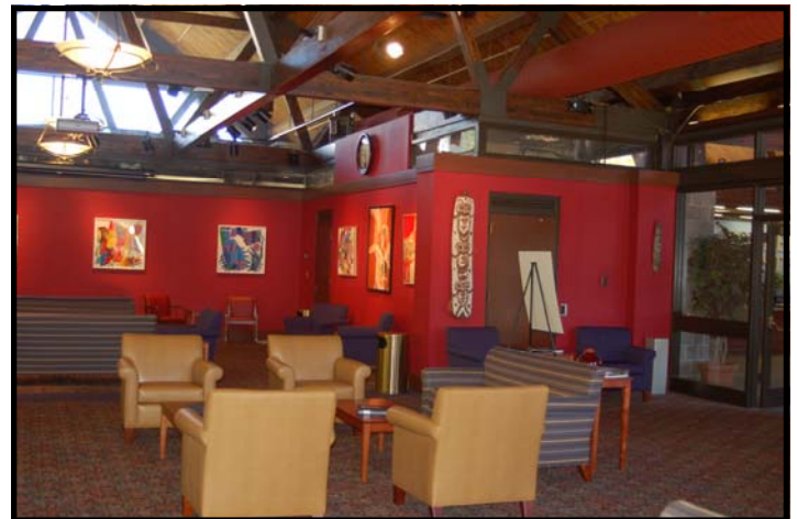
Villanova University President's Lounge; Villanova, PA Architect: H2L2 Architects